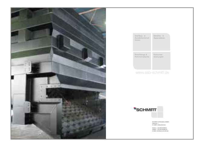
Steel construction and special designs