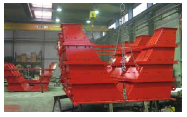
Steel construction and special designs

More information can be found on our web site at: www.ssb-schmitt.de, or in our catalogues.