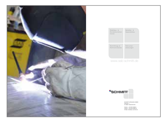
Containers and apparatus