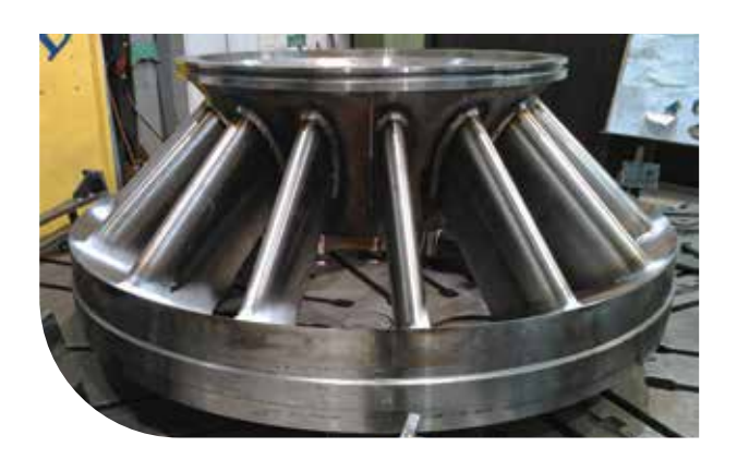
We will fulfil your requirements – We are happy to be there for you!